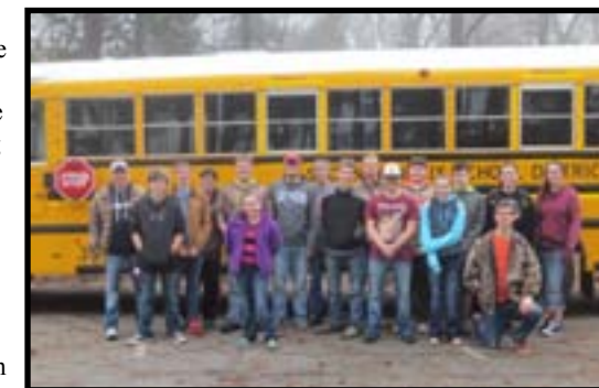
Senior high archery team