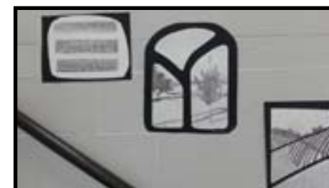
Above: Students walked around campus taking pictures and then used graphite to compose triptychs from their original photographs.

Student artwork was recently on display during the fall art show. Some of the subject matter included the color wheel and triptychs. Elementary students used oil pastels to tell a family story. The artwork was on display in the gymnasium. Mrs. Watson is the art teacher.